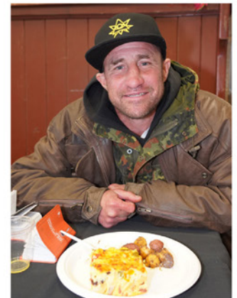
Men and women come in every day to receive nutritious meals.

We're thrilled by what God is doing and excited that we are in talks to expand even farther in the future. We're in negotiations to expand south into Rohnert Park and Petaluma. Be on the lookout for more exciting news!