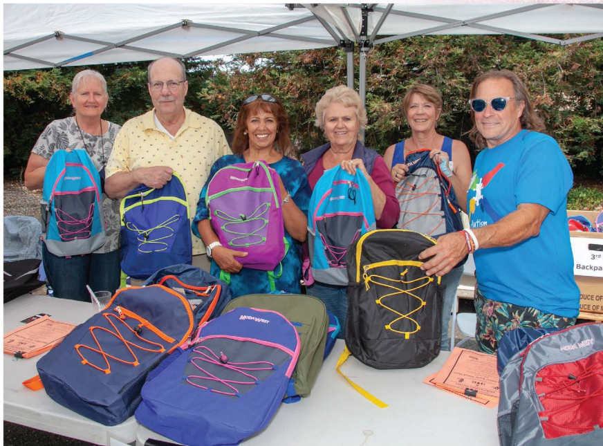
City Kids volunteers are ready to distribute backpacks to students.