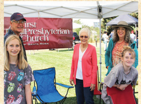
City Kids volunteers are ready to distribute backpacks to students.