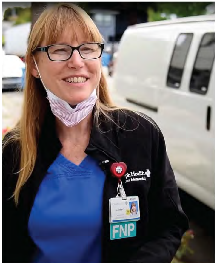
Prior to the COVID-19 pandemic, St. Joseph's Mobile Medical Clinic was in six locations (including the Mission). Now they are in 12 and continuing to expand.

"We go to places where people don't have insurance. We go to places where people don't have the means to get care otherwise. I've never in my life had a job like this one where we were able to serve as much as we are. It's a very rewarding feeling!"